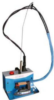
Mod. 1F43 + electric iron