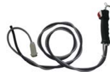
Mod. steam gun